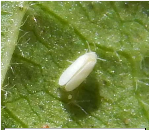
Sweetpotato whitefly, Bemisia tabaci, on cotton. 9/17/2015