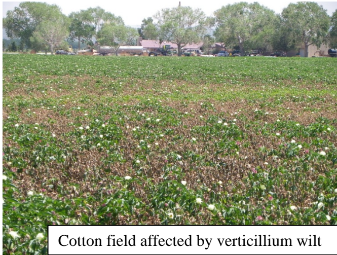
Cotton field affected by verticillium wilt

strain that resembles Texas cotton root rot, but in this case the roots are not rotted and their tissues exhibit a light color. At this point, no chemical control measures exist to battle this soil-borne disease. Rotation to alfalfa