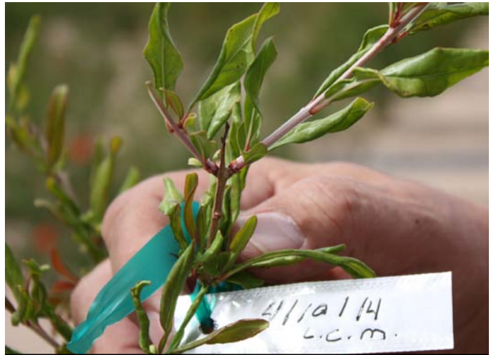
Leaf curling in pomegranate plants. Tornillo, 4/10/14

yield and best control tactics available. Pomegranate is one of the alternative crops for agricultural diversification that could be used in El Paso region because it has a high salt tolerance and does well in marginal soils. Although pomegranate plants have been established in El Paso for many decades, they have not been utilized as a commercial crop until very recently. Consumption of pomegranates offers many health benefits. Additionally, its current prices, appealing plant architecture, and showy flowers make it a very promising plant for production of fresh fruits, juice, seed oil, or as ornamental.