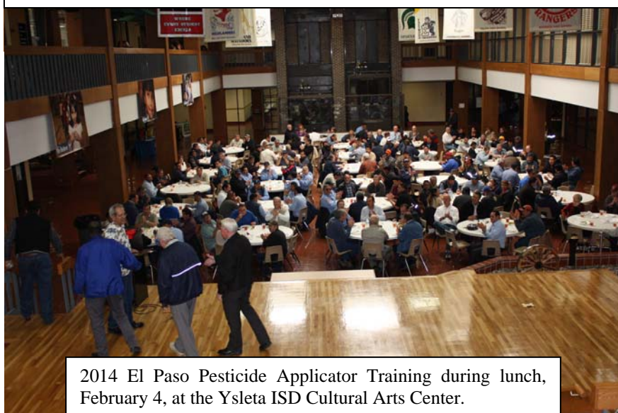
2014 El Paso Pesticide Applicator Training during lunch, February 4, at the Ysleta ISD Cultural Arts Center.

The Texas AgriLife El Paso IPM Program is partially supported by the following organizations: